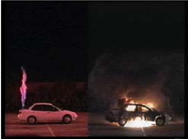
Photo 3 - Time: 1 min, 0 sec – Hydrogen flow is subsiding, view of gasoline vehicle begins to enlarge.