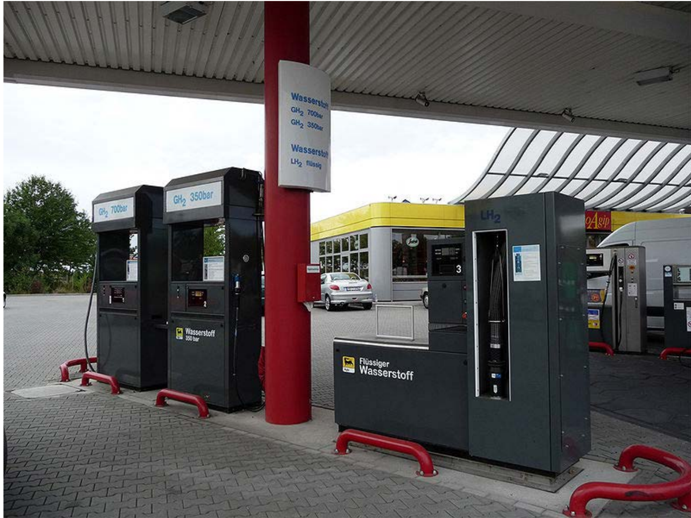
Hydrogen filling station near Frankfurt, Germany. Picture in public domain.