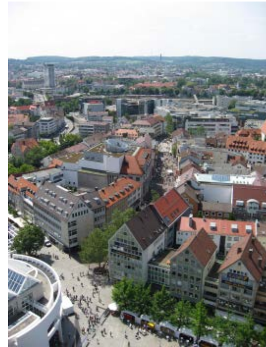
Ulm, a German city that is the solar energy “capital “of the world.