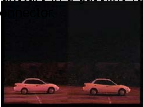
Photo 1 - Time: 0 min, 0 sec – Hydrogen powered vehicle on the left. Gasoline powered vehicle on the right.