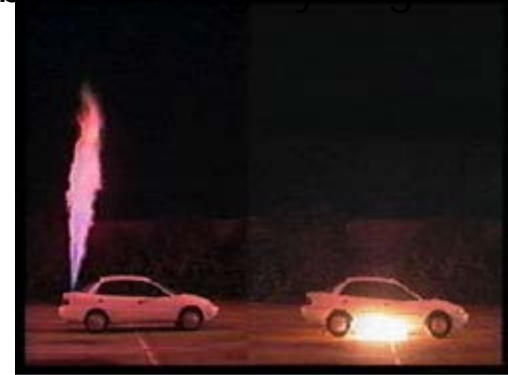
Photo 2 - Time 0 min, 3 seconds – Ignition of both fuels occur. Hydrogen flow rate 2100 SCFM. Gasoline flow rate 680 cc/min.

Photo 1 - Time: 0 min, 0 sec – Hydrogen powered vehicle on the left. Gasoline powered vehicle on the right.