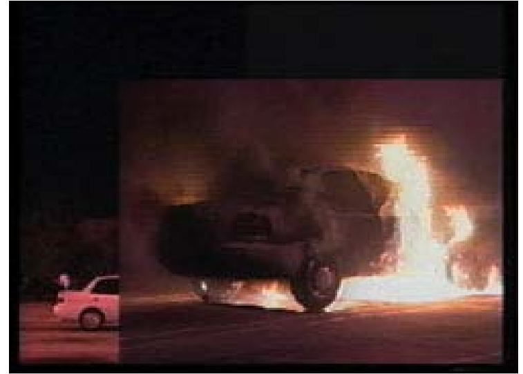
Photo 4 - Time: 1 min, 30 sec – Hydrogen flow almost finished. After this, the gasoline powered vehicle burns violently

Story from http://evworld.com/view.cfm?section=article&storyid=482 . However, other research suggests that hydrogen can still be dangerous in confined spaces, and the debate continues!